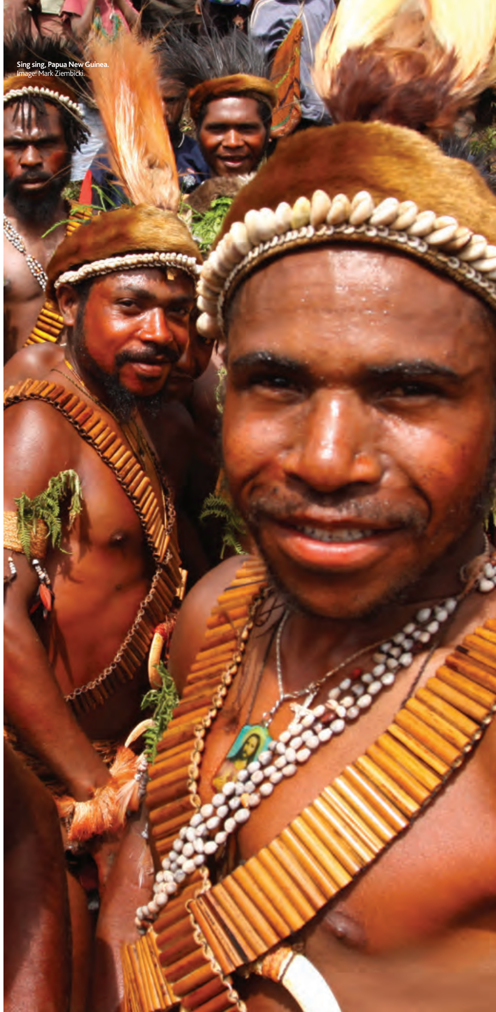
Sing sing, Papua New Guinea.