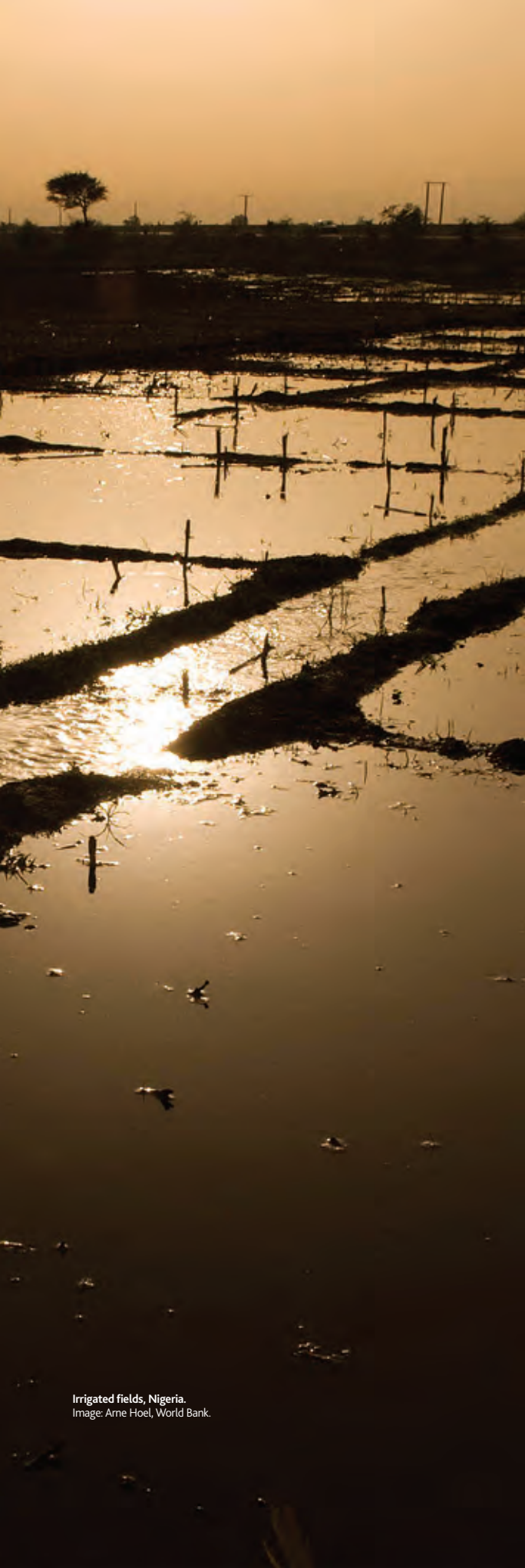
Irrigated fields, Nigeria.