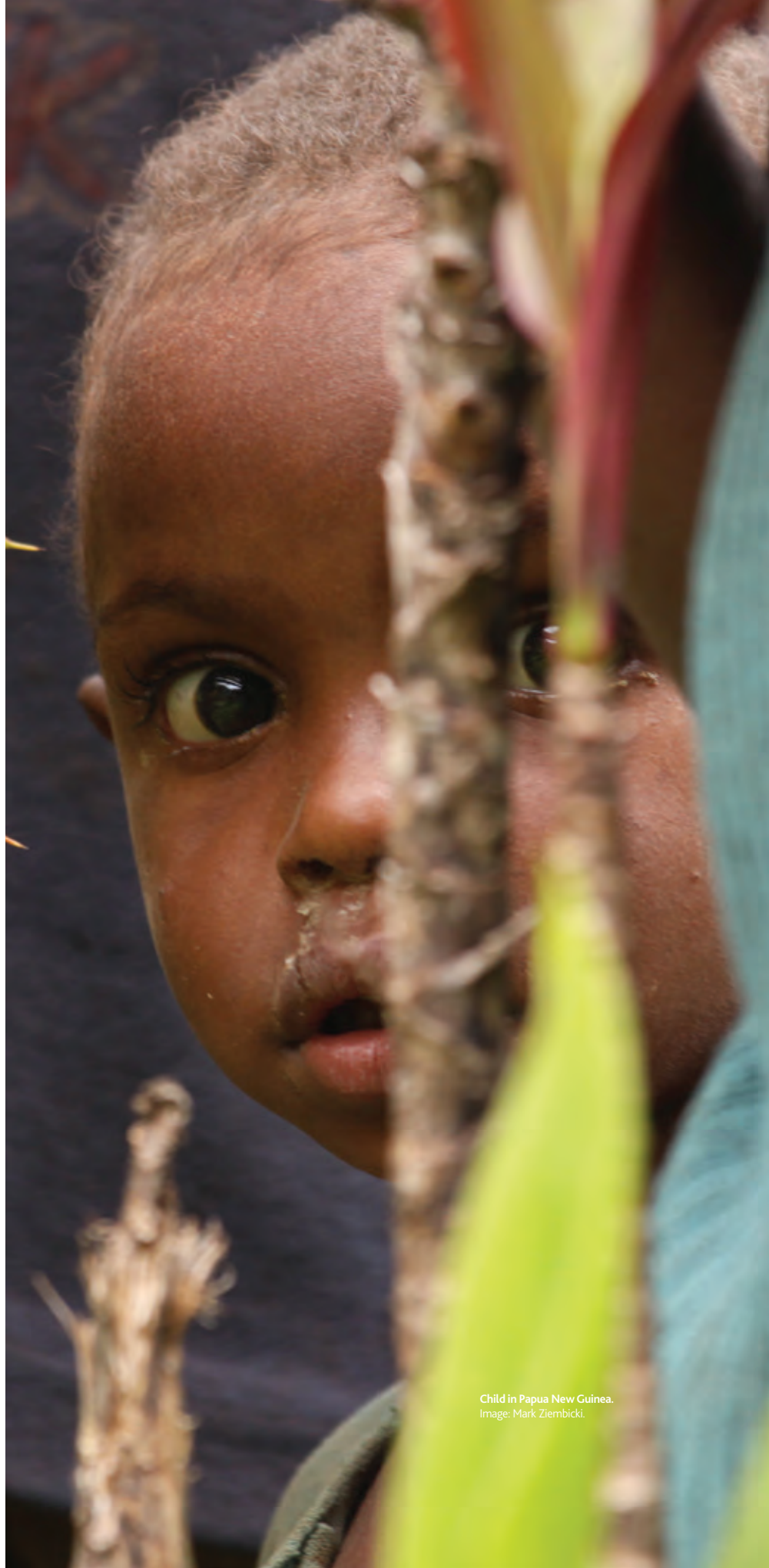
Child in Papua New Guinea.

The age structure in the Tropics differs quite significantly from the Rest of the World. Higher birth rates and lower life expectancy in the Tropics mean that children under 10 make up 23% of the population compared with 15% in the Rest of the World. Longer life expectancy in the Rest of the World equates to a much greater proportion of older age groups than in the Tropics. People over 70 years make up only 3% of the population in the Tropics compared with 7% in the Rest of the World. Based on median population growth and life expectancy assumptions, by 2050 the Tropics will be home to 60% of the world's children under 10 years old. Half of these children will live in Central & Southern Africa.