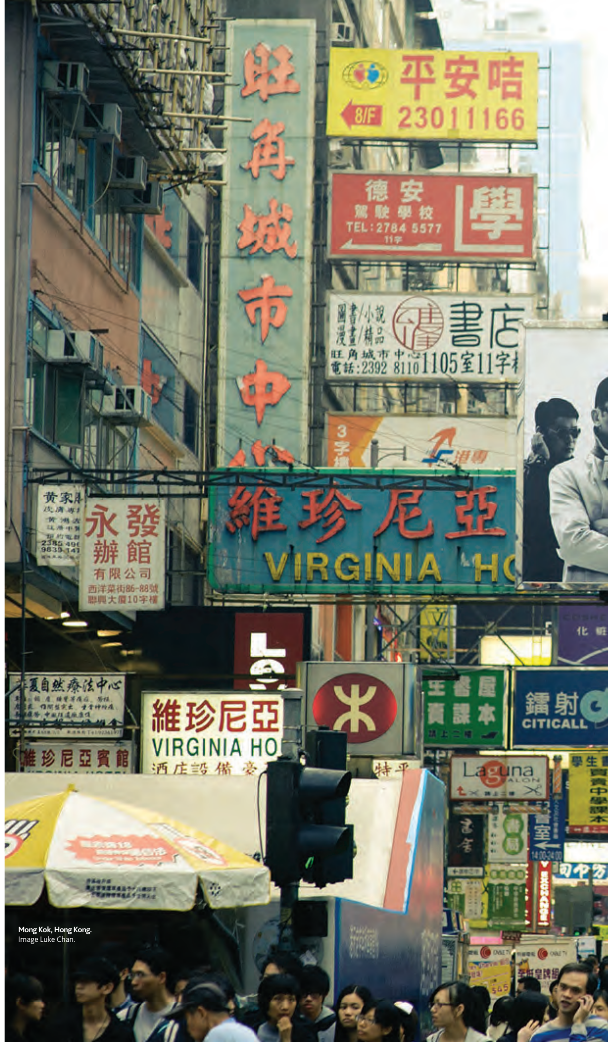
Mong Kok, Hong Kong.

This report also includes five essays, written by experts from around the world, exploring climate change, health and development in the Tropics.