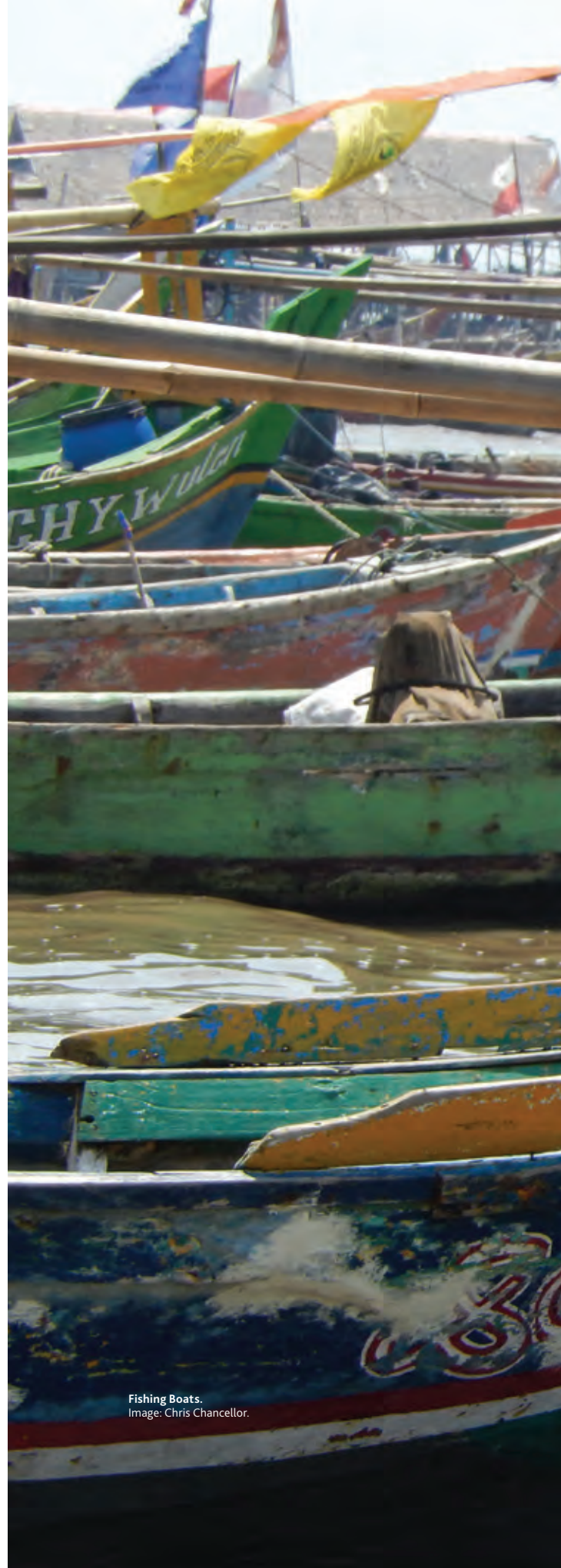
Fishing Boats.

Reflecting the broad international scope of the project are the key institutions involved. These include: Escuela Superior Politécnica del Litoral (Ecuador), Instituto Nacional de Pesquisas da Amazônia (Brazil), James Cook University (Australia), Liverpool School of Tropical Medicine (England), Mahidol University (Thailand), Nanyang Technological University (Singapore), National University of Singapore, Organization for Tropical Studies (Costa Rica), University of Hawaii – Manoa (USA), University of Nairobi (Kenya), University of Papua New Guinea and University of the South Pacific (Fiji).