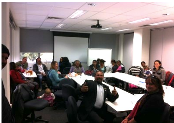
Bendigo Women and Men's FG, VIC

Thank you, it was a fantastic day, there has been a bit of talk in the community, one gentleman bailed me up at the railway station while I was waiting for my husband and expressed how much he got out of the session, and he stated that he actually learnt a couple of things that he did not know. I thought that was good positive feedback as the rest of the community members have been saying the same thing. So thank you it allowed our community to express their issues and brought about an understanding for the community (Focus Group Coordinator, Swan Hill).