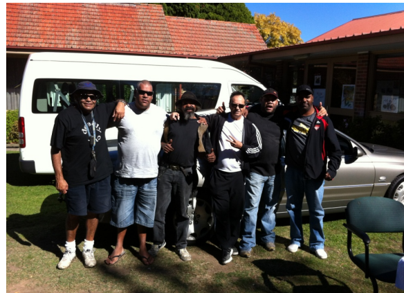
Heidelberg Men's FG, VIC

We would particularly like to ensure that FG participants are kept informed about ILNP progress and we will be linking them to social media and research outcomes over time, including through FG coordinators. We again must thank all FG participants and coordinators for the time given and care taken in providing us with valuable information.