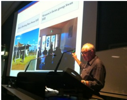
ILNP at Critical Criminology Conference, TAS

In 2012, the ILNP presented at the National Family Violence Prevention Legal Services Forum (FVPLS Forum), held in Cairns in May 2012.