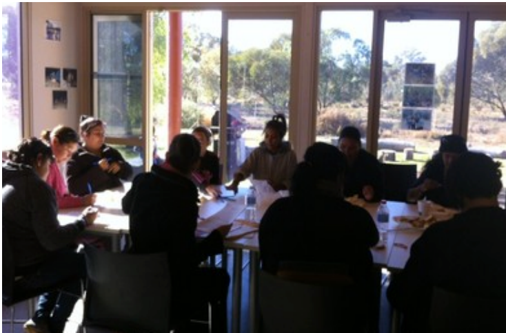
Robinvale Womens Focus Group VIC

We have used the same FG process in Victoria as we did in the NT. At each FG, all participants completed a questionnaire with ILNP team members to identify priority legal needs and issues relating to access to legal services. In most cases, FG participants also engaged in a group discussion about legal needs and services with ILNP facilitators. We now have a total of 124 questionnaires completed by FGs in Victoria (61 by men, 63 by women).