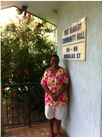
Thursday Island Focus Group Coordinator

Focus group participant feedback also continues to be positive, overall, as participants generally are able to walk away with a little more information about their rights and about what services are available to assist them with civil and family law problems. Part of this information-sharing occurs when participants discuss issues and solutions with each other as a group. Participation in the groups also leads, we have been told, to ongoing discussion in the community of relevant issues after an ILNP visit.