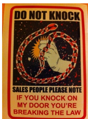
Consumer protection material provided to the ILNP by Brisbane stakeholder: Financial Counselling Australia

We continue to gather valuable information from both community members (focus groups) and from those working with community (stakeholders) during fieldwork. Thank you sincerely to all who have contributed in this way to the project over recent months.