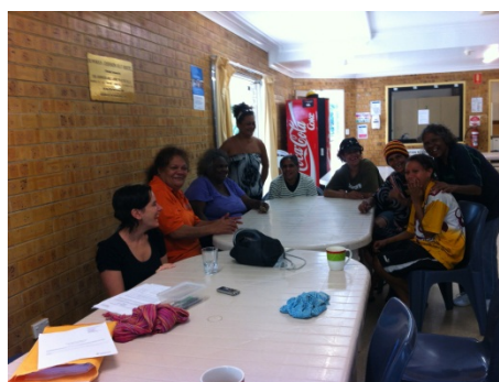
Brisbane Women's Focus Group

Stay tuned for a fourth progress report due out in November 2013 .