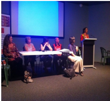
Formal presentations: launch of ILNP NT Report