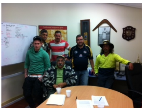
Framlingham Men's Focus Group

We now have a total of 161 questionnaires from Victorian focus group participants and have also conducted interviews with 71 Victorian stakeholder organisations . Although all the data from Victoria has yet to be analysed and will be discussed in more detail in the VIC Report , a few observations about issues commonly arising can be made at this stage. These issues are likely to present themselves in the finalised report.