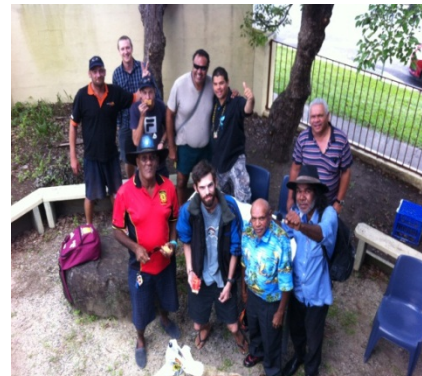
Brisbane Men's Focus Group

As the Victorian fieldwork is very close to finalisation (other than a small number of interviews to be conducted in Melbourne), it is worth saying a little about fieldwork in this jurisdiction.