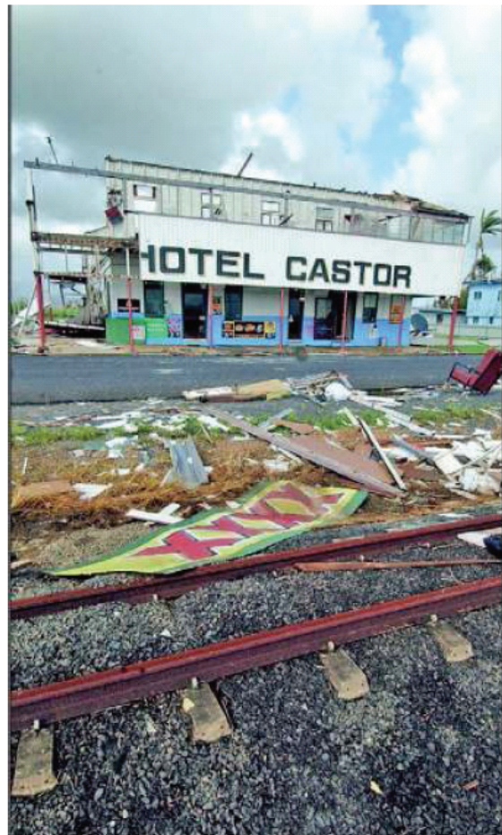
WRECKED... Mourilyan's Hotel Castor was badly damaged by Cyclone Larry

"From Townsville you could cover an area half the size of Queensland," he said.