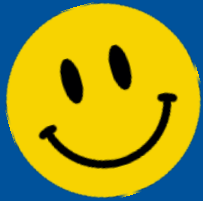
Image above: Smiley face with Alt Text.

Add alternative text to all images embedded in your MS Word document.