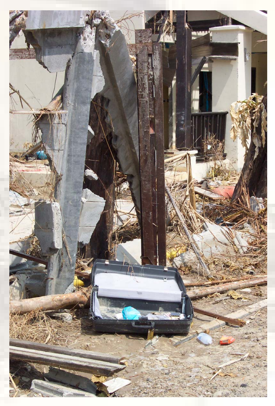
Khao Lak, Thailand, January 2005