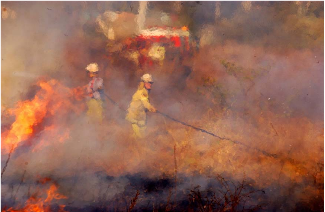
Bushfire in Thuringowa (Townsville) North Queensland 2003