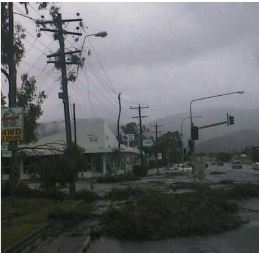
Mulgrave Road, Cairns after the passage of Cyclone Steve 2000