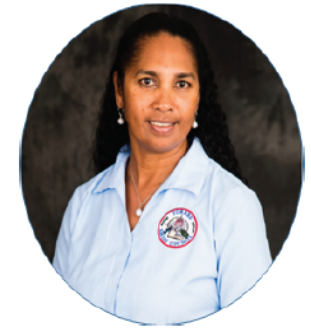
Cr. Vonda Malone Mayor - Torres Shire Council