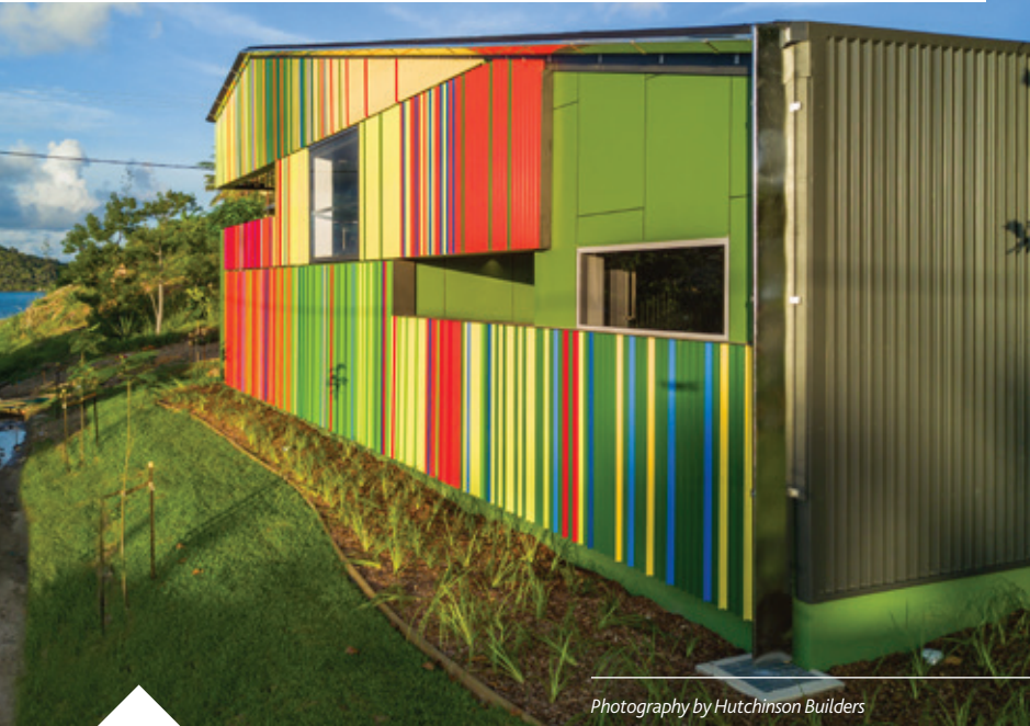
Photography by Hutchinson Builders