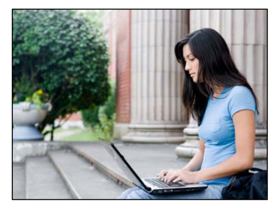
When students feel your institution is taking action on the issues they raise, they are more likely to do online evaluations, and give many more comments.

Once students perceive that your college is taking steps to correct any issues they raise, they will more likely take part in the next online evaluations, and your response rates will gradually improve over time.