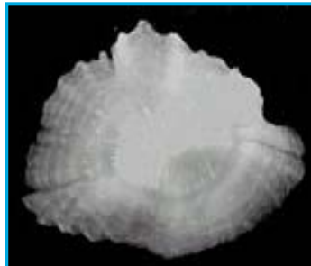
Figure 2. Whole otolith sample.

The technique is also highly subjective in the visual interpretation of growth rings, particularly for many tropical fish species where banding patterns are highly variable. Process and interpretation error can result in age estimates that differ by as much as a factor of three among investigators.