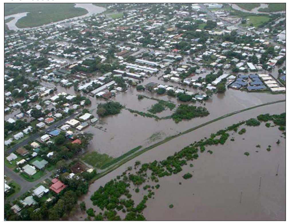
Floods and climate change impact Scenarios: Part of the Gooseponds and Barnes Creek Road, North Mackay, 15<sup>th</sup> February 2008

The Pioneer River runs out to sea through the city of Mackay. Relatively small in area, with steep slopes in parts of the upper reaches, the catchment of the Pioneer poses a flood threat to the town. Major flood levels have been reached 20 times since 1884. The rainfall event on 15<sup>th</sup> February 2008 was extremely intense and rare (100 year average recurrence interval). Around 4000 homes were flooded.