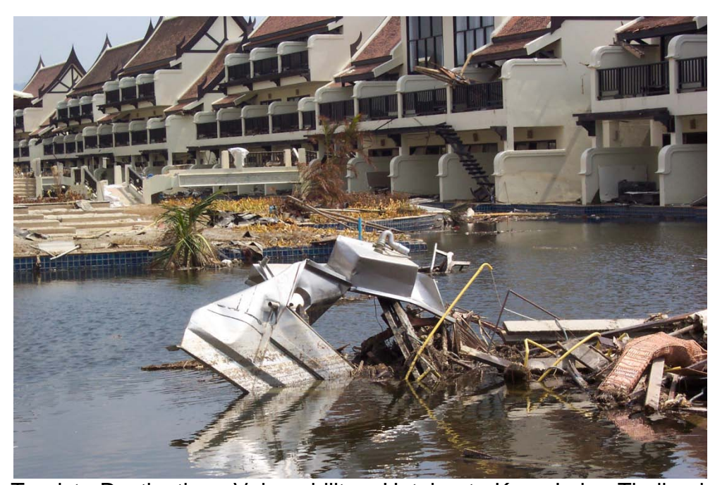
Tourist Destination Vulnerability: Hotel at Kao Lak, Thailand destroyed by the 2004 Tsunami, already back in business.

Through research, documentation, and analysis of the recent experiences of crisis in the internationally renowned tourist destinations of Bali and Phuket, the study has produced a comprehensive series of practical ("all-hazard") strategies for developing a more holistic, integrated approach to effective destination crisis management - implemented at the local community level. This study is near completion.