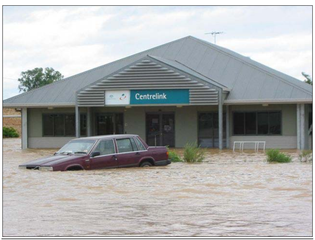
Infrastructural and Built Environment Vulnerability: Institutions flooded in Charleville floods, 2008

are already occurring such as cooperative emergency management planning and whether regulation may be needed to encourage better long-term planning for the impacts of climate change, where the market operates on short-term gains (for example, development is continuing in high risk locations such as low lying coastal and bushfire prone areas because land and property sales provide revenue for local governments) and mechanisms by which to ensure that new property developments and infrastructure are constructed in a risk appropriate manner consistent with local hazards. This project focuses on the use of building codes, land-use planning and housing insurance as key regulatory mechanisms in climate change adaptation. The first stage of the research has been the identification of a stakeholder reference group in the areas of planning, building standards, housing and insurance. This group can contribute knowledge of the industry and regulatory framework and advise the research group of the viability of solutions and strategies. The background to the research has started with a summary document of existing literature in the areas of planning, building codes and housing. This literature review has been circulated amongst all of the research group and the stakeholders. Case study locations and areas have been identified for the next stage of the research, where data will be collected.