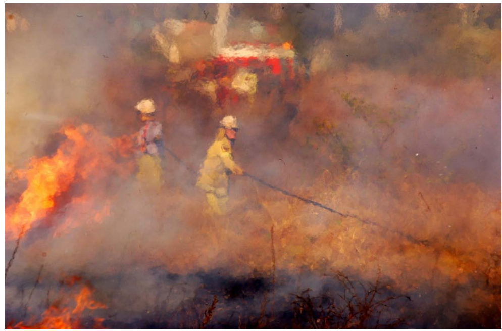
Bushfire Risk and Communities: Fighting bush and grass fires in rural Thuringowa (Townsville Bulletin)

Nevertheless, presentations still occur, with contributions to QFRS at The 2010 Volunteers Summit and training sessions for Community Education Officers.